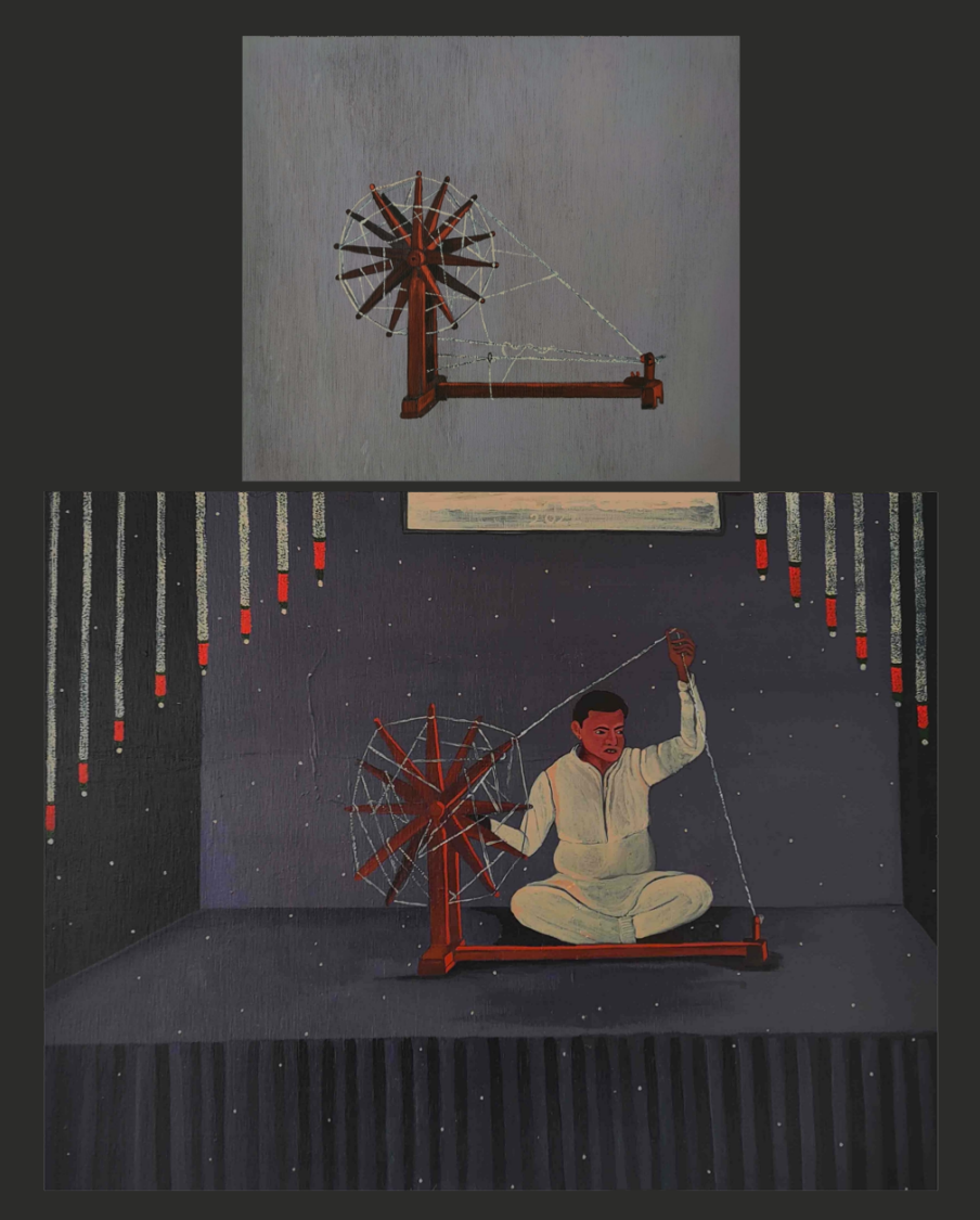
Abul Hisham Entangled spinning wheel, 2022 Acrylic on wood 56 x 56 cm + 21 x 23 cm AbHi012