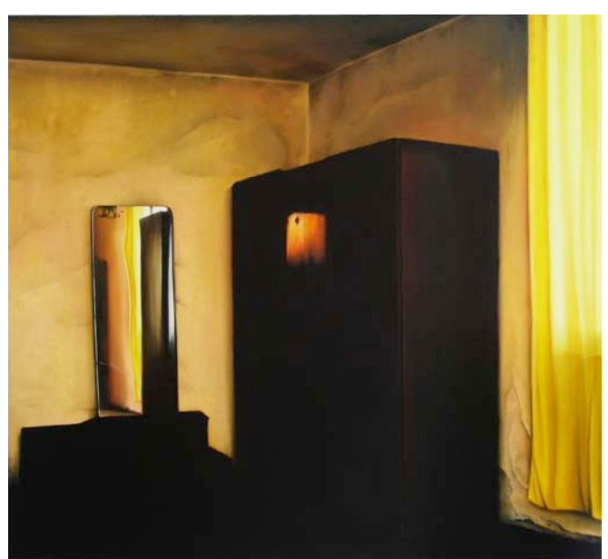
Grandpa's House, oil on canvas, 2008

Marc Jancou Contemporary is pleased to announce the opening of the exhibition Night After Night . This will be Slawomir Elsner's first solo show in New York.